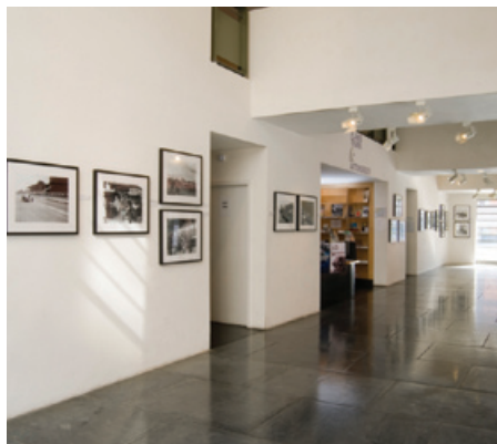
The gallery space at the NPA, which will host several exhibitions this summer