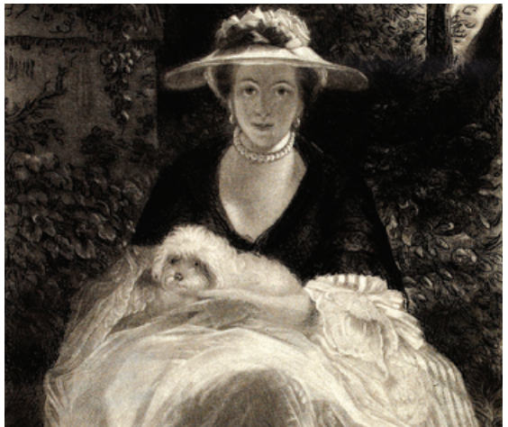
Celebrated 18th century beauty Nelly O'Brien, from the Elmes Portrait Collection (EP OBRI-NE (1) I).

Follow us on Twitter and Facebook for information about events as well as insights into our digitized collection.