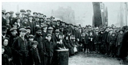
Crowd of workers gathered on the Dublin docks during the Lockout.

The Dublin Lockout chronicles the story of a dramatic industrial conflict in 1913-14, against a backdrop of Irish social and political conditions. A partnership between the National Library and the 1913 Commemorations Committee of ICTU, the exhibition runs throughout 2014. You can also explore the content at www.nli.ie/lockout