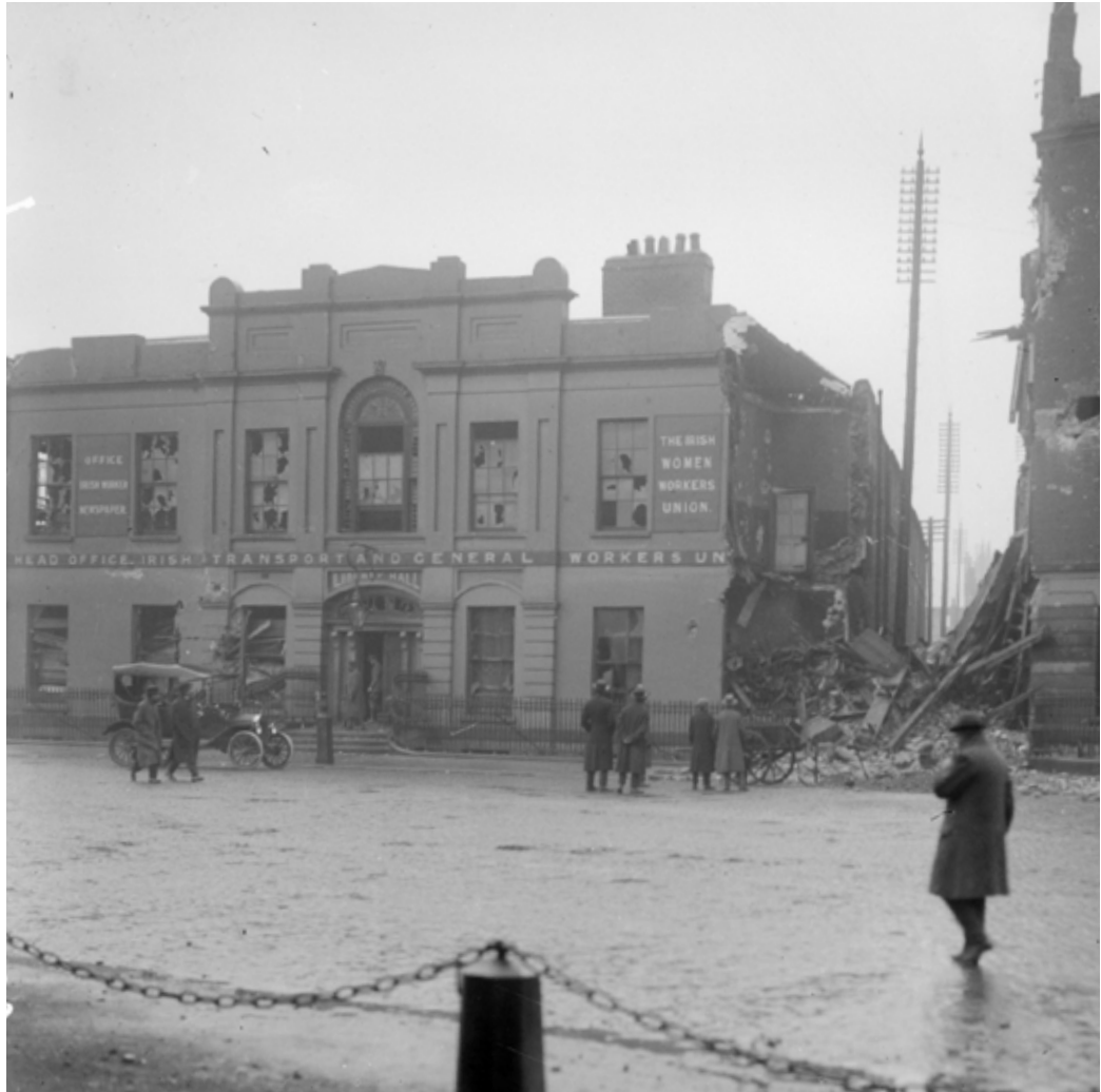
Liberty Hall after the bombardment by the Helga on the Wednesday of Easter Week.