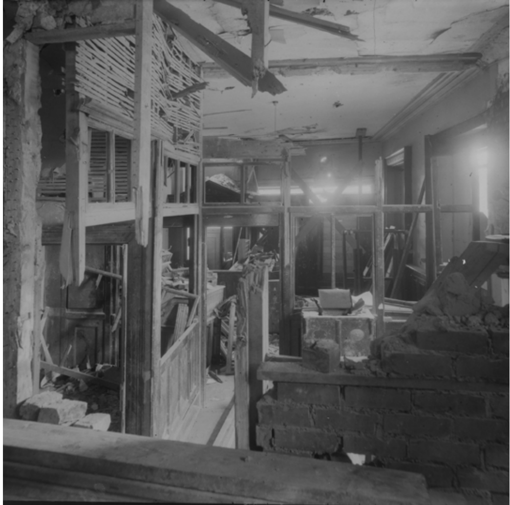
The interior of Liberty Hall was more badly damaged than the exterior as some of the shells exploded inside the building. (Keogh 218).