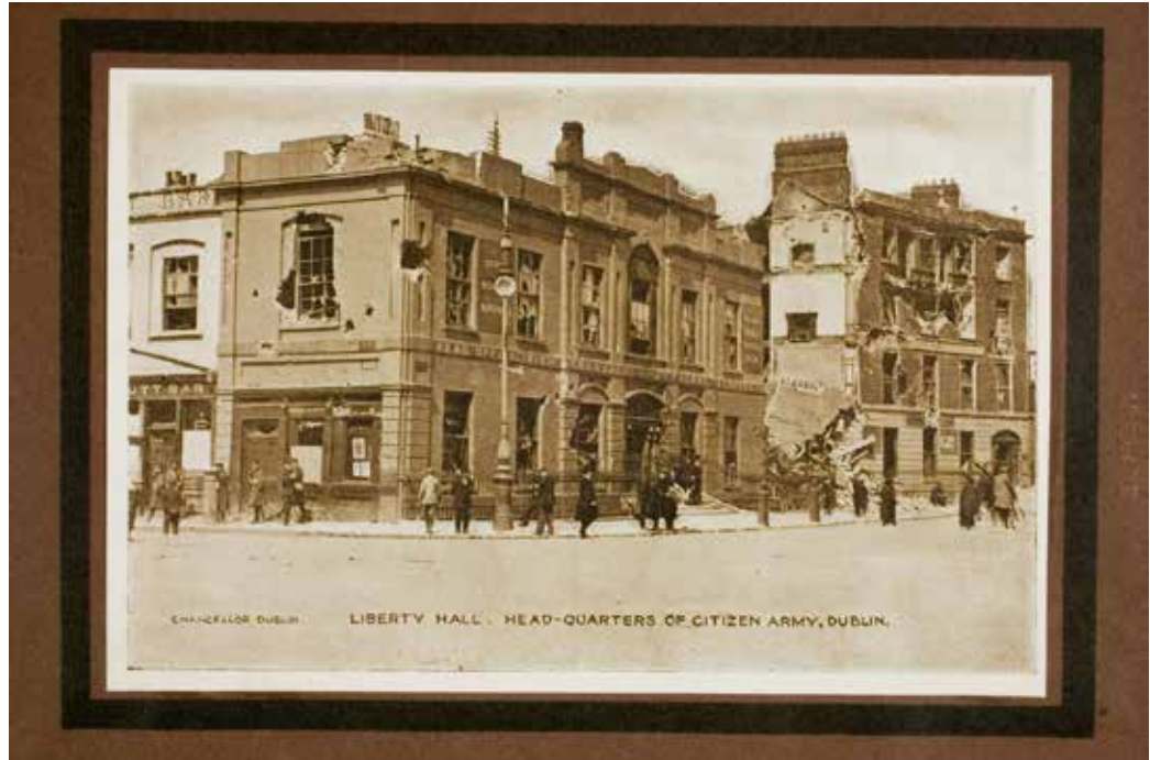
Liberty Hall after the bombardment by the Helga on the Wednesday of Easter Week. (Album 254).