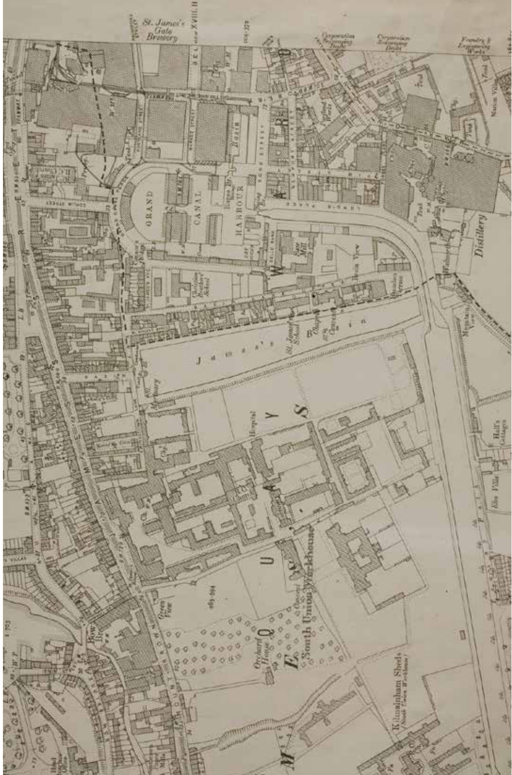
Map showing the Marrowbone Lane area. The distillery is at bottom right. (Ordnance Survey, 1:2,500 (25 inches to mile), Dublin, sheet XVIII, 1911; scale altered).